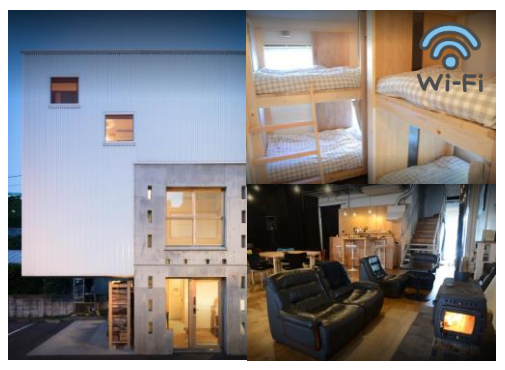
5minutes to school on foot w/o breakfast Located in the city center

18minutes to school on foot w/o meal Japanese-style or western-style room they have.