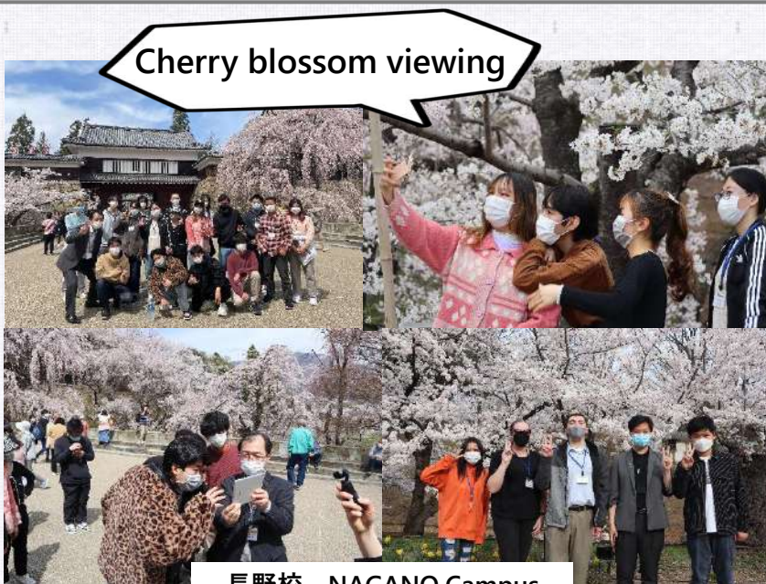
Cherry blossom viewing