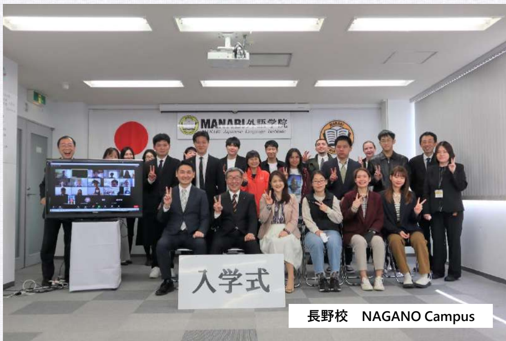
長野校 NAGANO Campus