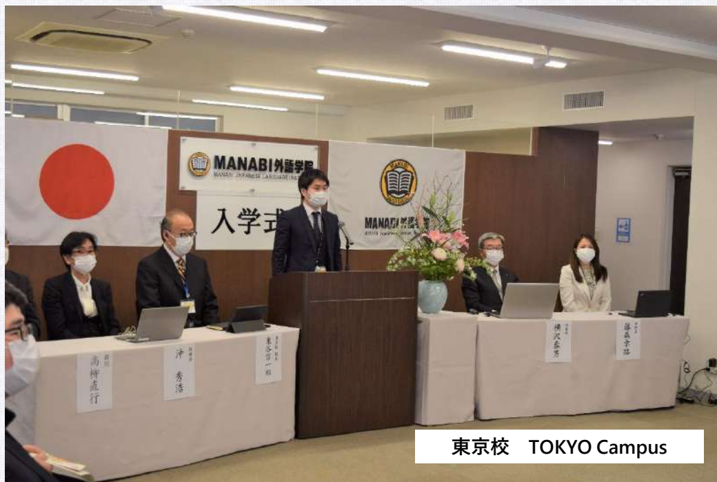
東京校 TOKYO Campus