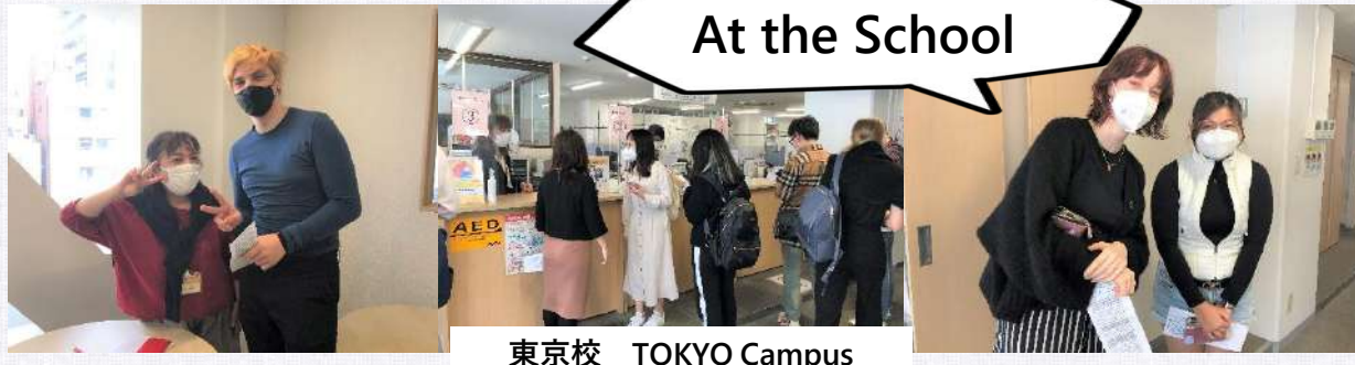
At the School