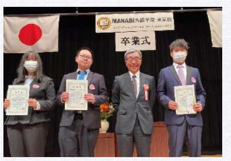
Scholarship for famous universitiesRecipients