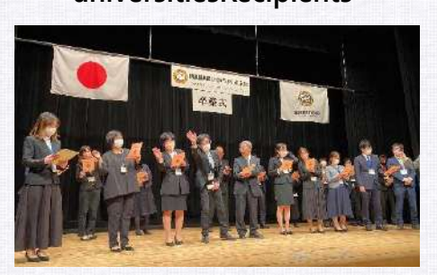
Gifts from Teachers

This was the first time in three years that we