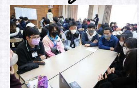
Visited a high school. We had a pleasant conversation in Japanese!