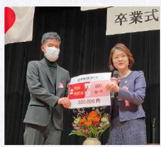
Special Rewards Representative