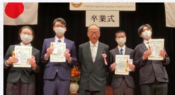
Prize for perfect attendance

This was the first time in three years that we