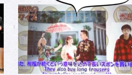
The entire student, led by the film crew, thought about, practiced, and created the video.