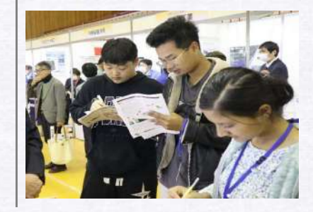
We learned a lot from viewing and explaining the various exhibits!